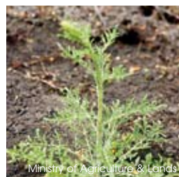
Ministry of Agriculture & Lands