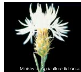
Ministry of Agriculture & Lands